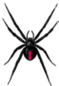
Actual size of an adult female redback