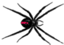
Actual size of an adult female katipo