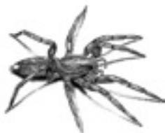
Actual size of an adult female white-tailed spider